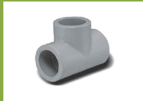
Weld Type: Socket