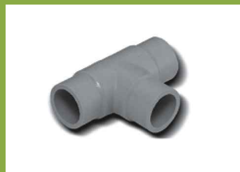
Weld Type: Butt