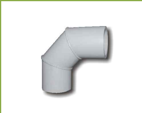
Weld Type: Butt

30°, 45°, 60°, 120°, 150° also available