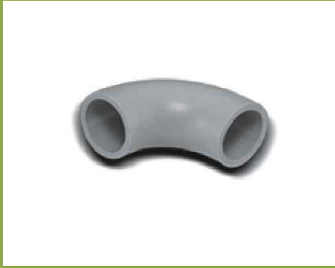
Weld Type: Butt